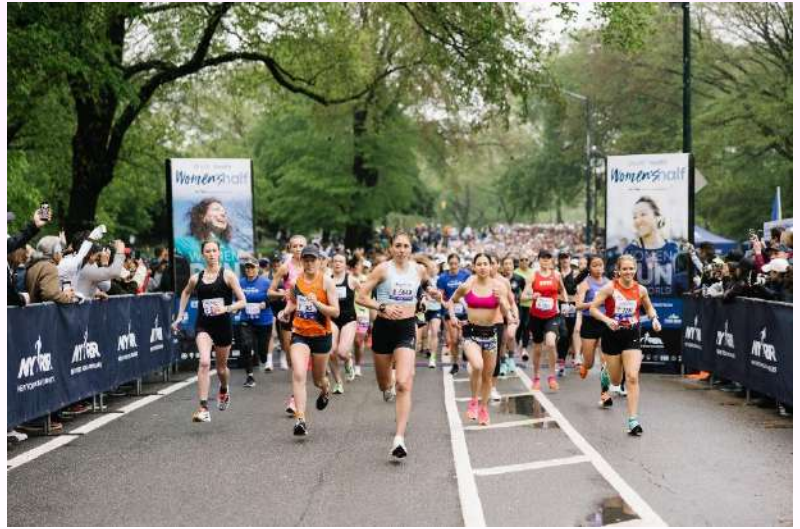
Registrations until April 3, 2024, subject to bib availability.